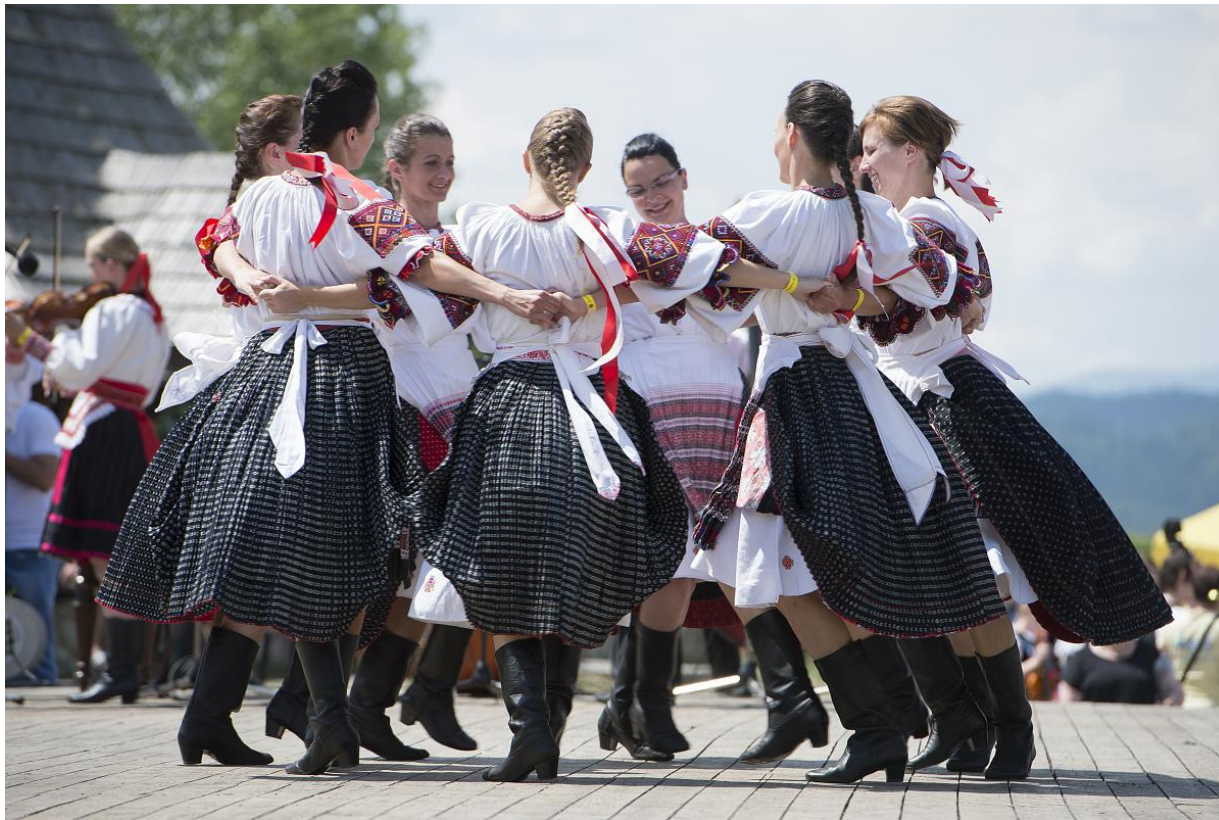
Photo from 2014 festival